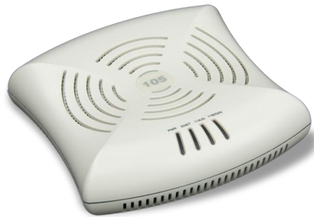
Figure 3 - AP-105 Wireless Access Point

The Aruba AP-105 is high-performance 802.11n (2x2:2) MIMO, dual-radio (concurrent 802.11a/n + b/g/n) indoor wireless access points capable of delivering combined wireless data rates of up to 600Mbps. This multi-function access point provides wireless LAN access, air monitoring, and wireless intrusion detection and prevention over the 2.4GHz and 5GHz RF spectrum. The access point works in conjunction with Aruba Mobility Controllers to deliver high-speed, secure user-centric network services in education, enterprise, finance, government, healthcare, and retail applications.